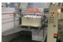
Raw Material Cut Paper

Our company specializes in the design and production of paper packaging and printing, providing color boxes, color boxes, corrugated boxes, packaging boxes, printing boxes, folding boxes, gift boxes, printing boxes, mask boxes, fruit/food packaging boxes, custom boxes and other products. Can meet your diversified needs. The company's products use white cardboard, art paper, double-sided paper, colored paper, kraft paper, corrugated paper, fancy paper, woodless paper, special paper and other materials, combined with advanced sets of printing and post-press processing equipment, excellent design, Printing, service and other professional personnel services, with "outstanding team, excellent design, excellent service, excellent products" as the development concept, adhere to the "quality first, customer first, reputation-based" business policy.