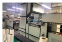
Coating and glazing