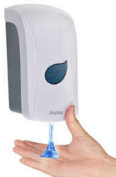
Hand Soap Dispenser