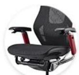
GTCHAIR Wire Control Mechanism