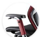
5D Paddle Shift Wire Control Arms