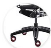
Korean SHS Class 4 Gas Lift 350mm Aluminum Laser Base GT-68mm Gaming Koo Castors with Noise Reducing Caps