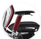
Seat Depth Slide Forward