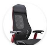
Materials Breathable High Elastic Korean Mesh