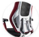
5 Levels Foam Lumbar Support