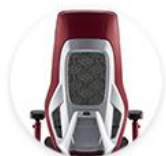
DSports Car & Rocket Dual Elements Design