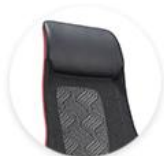
Build-in Leather Comfortable Headrest