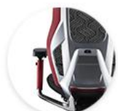
Elegant Aluminum Frame